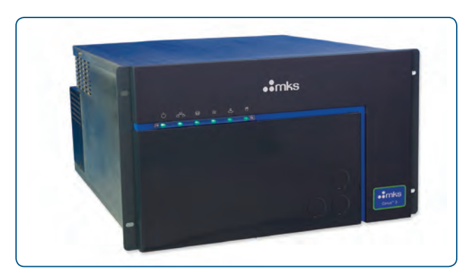
Cirrus 3 rack-mount configuration