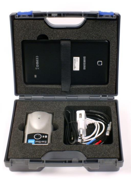
EmStat3 Blue in standard carrying case showing optional tablet